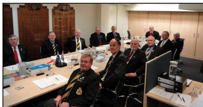
Photo – August State Council Meeting in the new Trooper Mark Donaldson VC Room at the recently renovated ANZAC House.

Dubbo is well advanced to hold the “RSL National Congress 2010” . Much help has been done by the Dubbo RSL sub-branch, The Tourist Information Centre, Local Government and the RSL Club Resort.