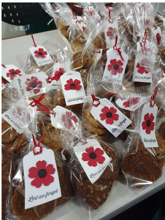
Anzac biscuits ready for sale with beautiful labels made by Sandy Rees